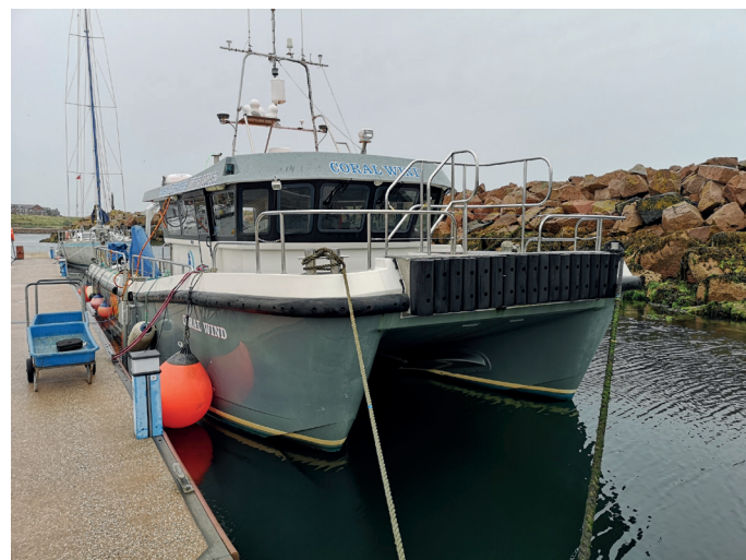
MV Coral Wind

The Edgetech 6205, a combined MBES and SSS system, was vessel mounted through a moonpool in the centre of the vessel. The use of vessel mounted SSS removed positional uncertainties associated with layback positioning in shallow water.