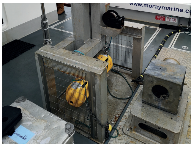
Moonpool deployed Edgetech 6205 (MBES/SSS)

iSURVEY was contracted to perform an acoustic inspection and cathodic protection survey of the 30" gas export line from Beryl Alpha to St Fergus Terminal (KP0.000 to KP3.100) at the St Fergus Landfall, North East Scotland.