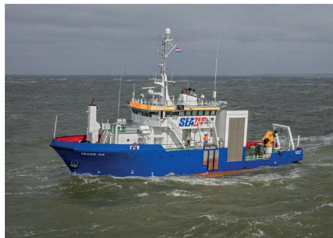
Vessel: SeaZip FIX

iSURVEY mobilised all equipment and personnel to the vessel, SeaZip FIX, in Rostock, Germany.